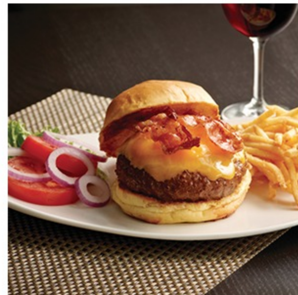
Morton's Prime Burger

Steamed Fresh Jumbo Asparagus Grilled Jumbo Asparagus Sauteed Broccoli Florets Creamed Spinach Creamed Corn Sauteed Brussels Sprouts Onion Rings Jumbo Baked Potato Sour Cream Mashed Potatoes Parmesan and Truffle Fries Sauteed Button Mushrooms Sauteed Fresh Spinach and Button Mushrooms