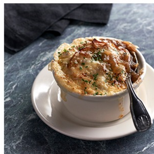
Baked Five Onion Soup