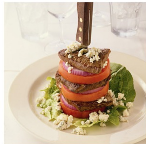
Stacked Prime New York Strip