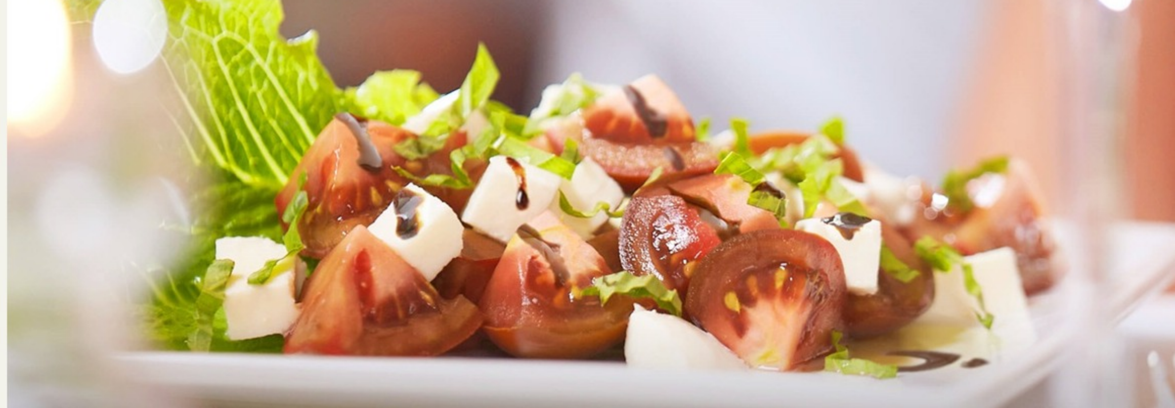
Fresh Mozzarella & Heirloom Tomato Salad

Our fresh soups and salads are a great start to a perfect evening at Ruth's Chris. All of our dressings and soups are made fresh in-house, using exclusive recipes.