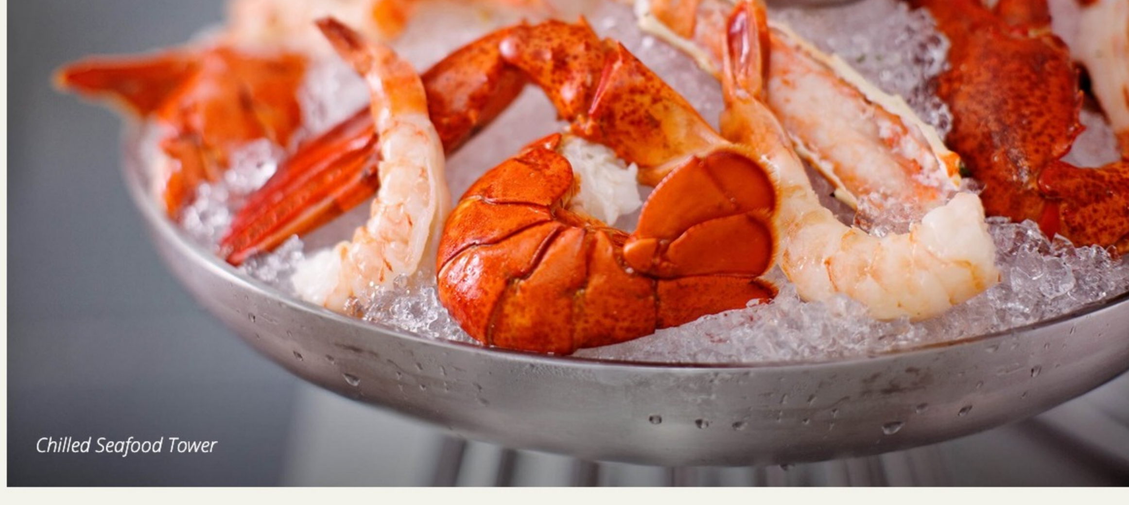
Chilled Seafood Tower

Start your Ruth's Chris experience off right with mouth-watering, internationally inspired appetizers and delectable sides. These dishes are prepared to order with fresh, high-quality ingredients, and guaranteed to complement any entrée.